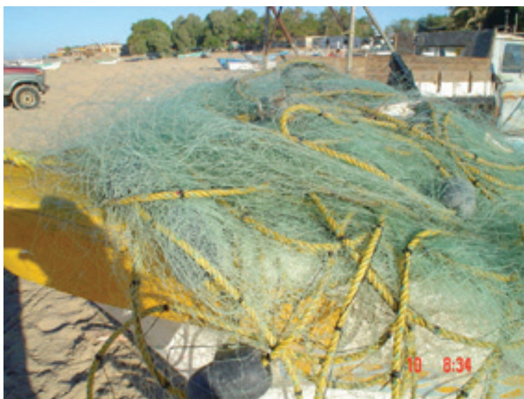
Fishing equipment.

In previous studies dealing with vaquita conservation (D'Agrosa et al. 2000, Jaramillo-Legorreta et al. 2007), the steps taken to protect the vaquita